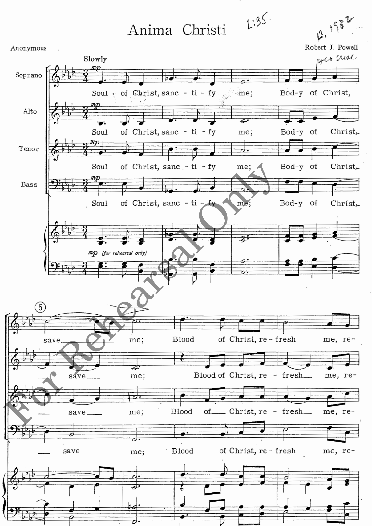
Copyright © 1977 Augsburg Publishing House. All rights reserved. Printed in U.S.A. Duplication of this material in any form is prohibited without the written consent of the publisher.